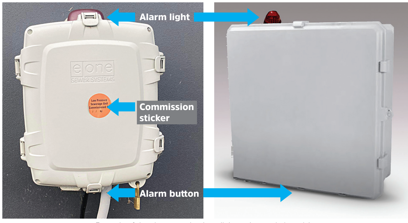
Example of the alarm panels, alarm light and commission stickers