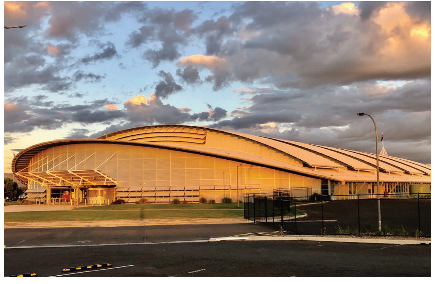
Australian Equine and Livestock Centre, Tamworth

Council held no controlling interest in any company for the 12 months period ending 30 June 2022.