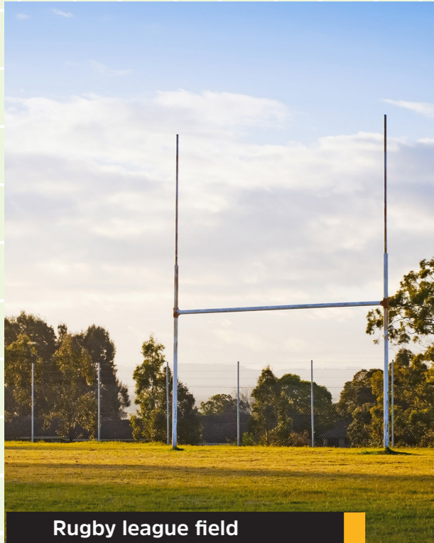
Rugby league field