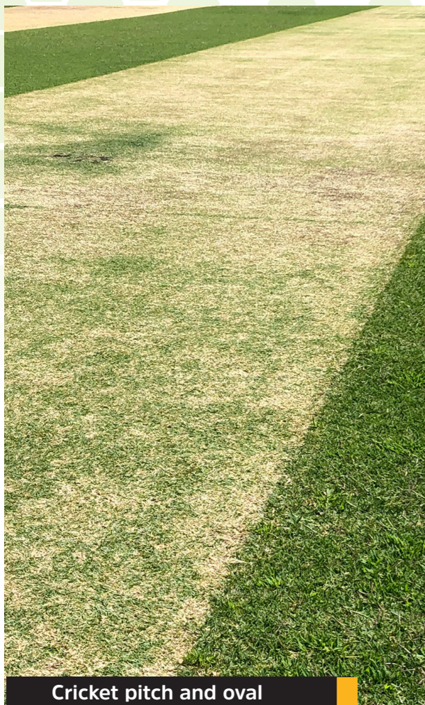
Cricket pitch and oval