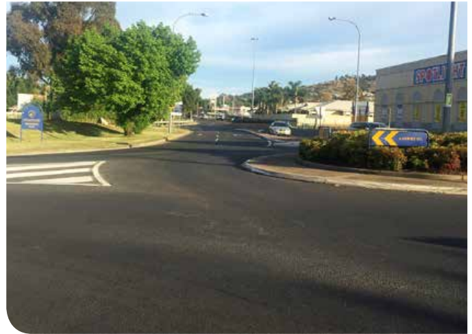
Planning is underway to upgrade the Jewry Street intersection on Manilla Road (Peel Street)

The 2017-18 State Budget included $150,000 to develop plans to upgrade the Jewry Street intersection on Manilla Road. Planning is progressing for this project, including surveying, traffic modelling and other investigations.