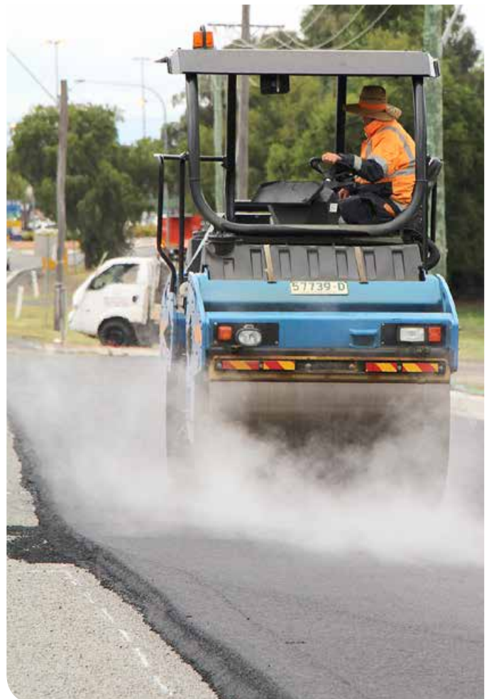
Final seal going on for the first stage of the Manilla Road upgrade

Please note there will be no formal presentations given, so community members can visit at any time during the session.