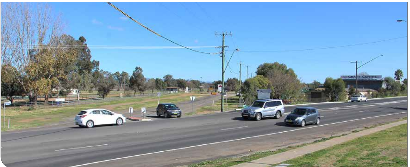
The Marius Street intersection on Manilla Road

The NSW Government is providing $3.5 million to fund the next stage of the Manilla Road upgrade between Tribe and Jewry streets, North Tamworth. This stage of the work will involve building a new roundabout at the Marius Street intersection.