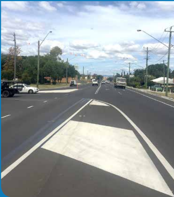
Tribe Street intersection where we extended the right turning lane into Tribe Street, built a new slip lane onto Manilla Road from Tribe Street and resurfaced Manilla Road.