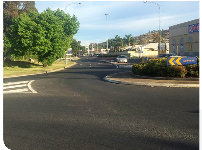
The existing Jewry Street intersection

Construction of the new bridge, which is being funded by the Australian Government, is expected to be completed in May 2019 with associated further roadwork to then be completed.