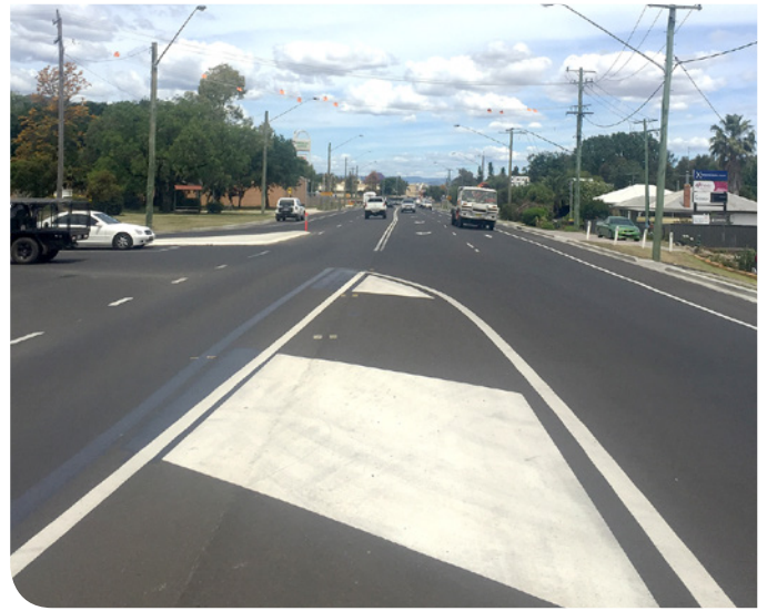
The existing Tribe Street intersection

The Jewry Street intersection upgrade will take place alongside the construction of the Jewry Street bridge duplication and is expected to take about three months to complete, weather permitting.