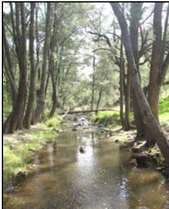
Figure 53: Woodsreef Reserve, 2006.

The loss of habitat astonished me. The skyline along distant hills often consisted of a line of dead trees. Most paddocks had little vegetation, sometimes an old tree standing alone. Environmentalists describe these trees as 'the living dead'. ... Within my lifetime the bush I once knew has disappeared. When we returned home I realised this area along the North West slopes of NSW was one of the few places where birds of the once vast grassy White Box woodlands, which previously stretched from Victoria to the Queensland border, might survive. ... My knowledge of travelling stock routes gained in my years as a livestock agent tied my thoughts together. There is a way to protect these vital remnants, to identify the public access to these Crown Lands and through overseas and Australian bird watchers let the whole community know these places exist by drawing attention to them. There are these ecological niches almost everywhere, begin to let the nation know this is a challenge, a way to save what is left. 147