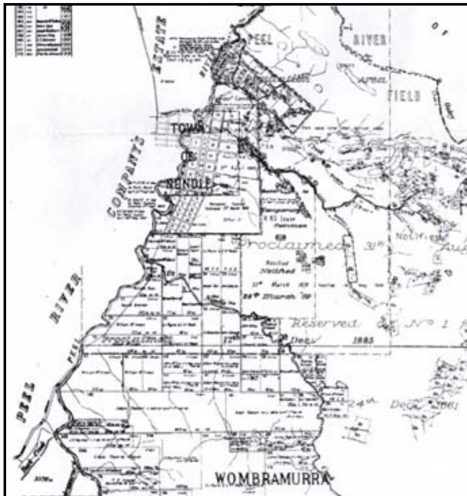
Figure 7: Detail from map of Parish of Nundle, County of Parry, Land district of Tamworth, Third edition 30 August 1904.