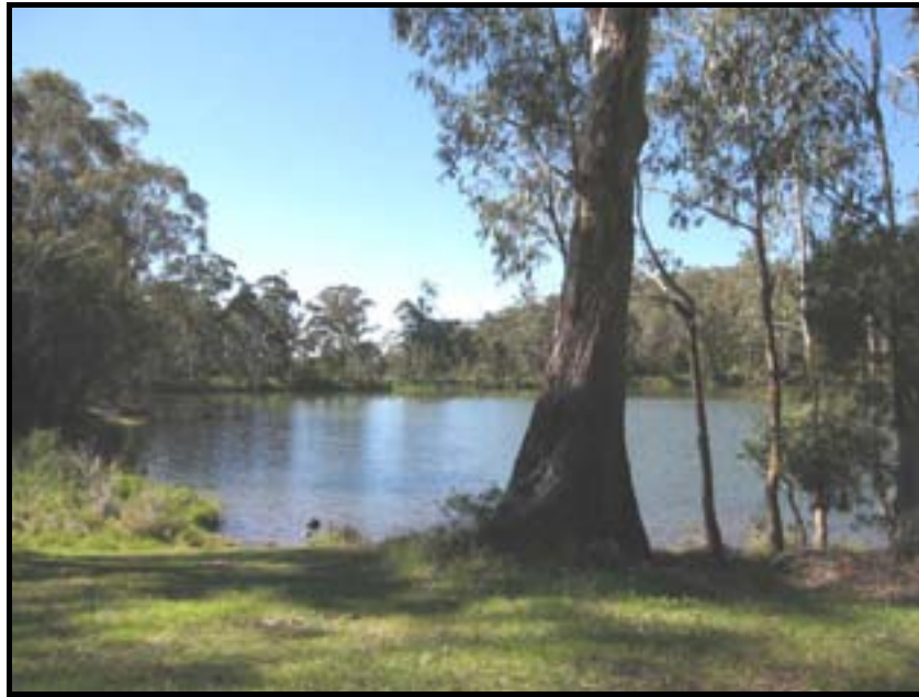
Figure 10: Sheba dam, 2006.

The building of the Sheba dams provided a reliable supply of water and inspired confidence, so that new mining companies were floated and additional machinery installed in older mines. But within a few years the peak of the gold rushes was past. The Mount Ephraim Mine closed in 1890 and its heavy machinery was moved to Queensland, and one by one mines at Bowling Alley Point, Hanging Rock and Nundle ceased working. There were later attempts to win gold from the diggings, but they were unsuccessful. The Tamworth Gold Mining Company began operations on the Nundle goldfields in 1897 but failed to make a profit and after only a year was reduced to crushing ore for other companies. The Company folded in the early 1890s. Between 1905 and 1917 the Nundle Gold Dredging Syndicate undertook dredging operations in the Peel River and Oakenville and Happy Valley creeks to extract the remaining alluvial gold, but it met with limited success. Rock bars and boulders often damaged the dredge.