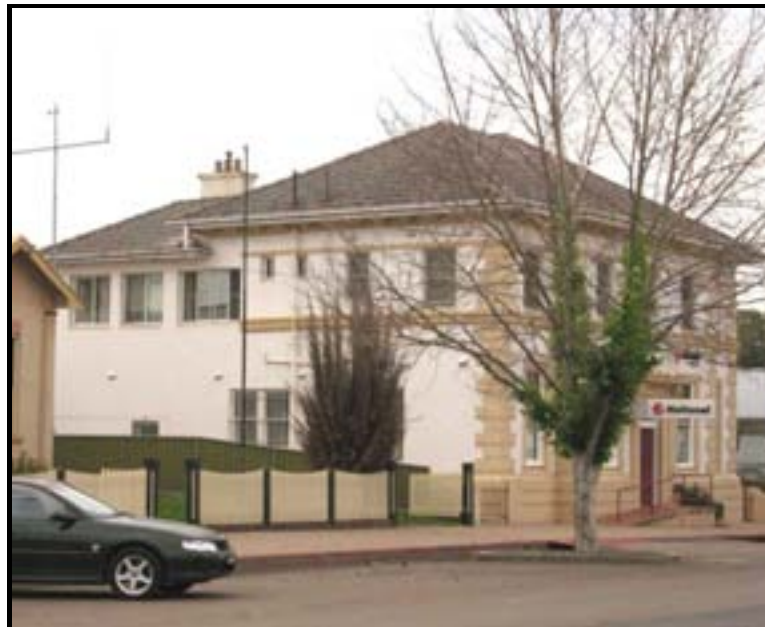
Figure 49: National Australia Bank, Barraba, 2006.

Deregulation of the banking industry and the subsequent entry of foreign banks into Australia in the mid 1980s posed significant challenges to the established banks. These were met initially with restructuring and the development of new products, many targeted to meet the requirements of specific groups within the community. Computerisation and technological developments such as automatic tellers and internet banking revolutionised the banking industry, setting the stage for drastic restructuring, staff cuts and closures of branches in rural areas. Like many rural centres in New South Wales, Barraba has been affected by the withdrawal of banking and financial services by the established retail banks.