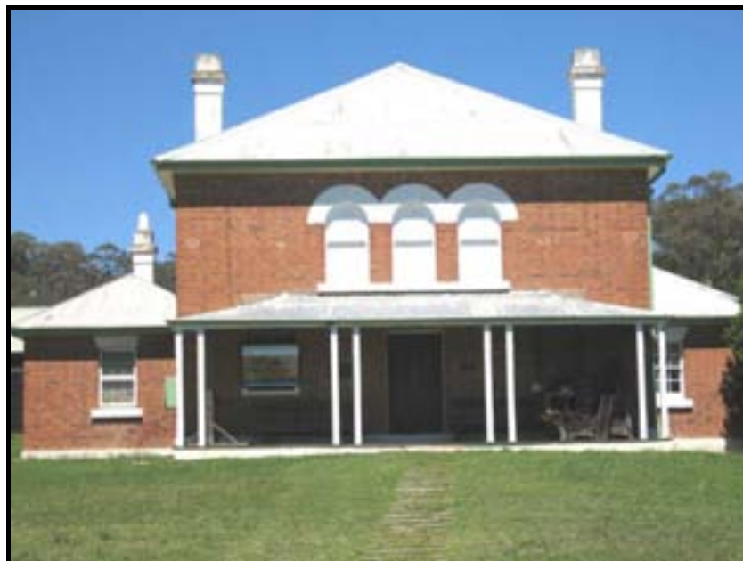
Figure 13: Nundle court house, 2006.

Nundle also has its lockup, an institution seldom untenanted, and this speaks volumes for the activity of the police and the retiring disposition of some of the residents. 88