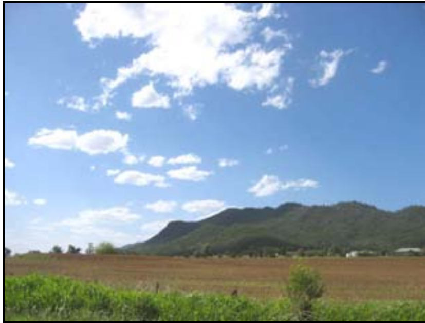
Figure 1: Thunderbolt's Bluff, north of Manilla, 2006.