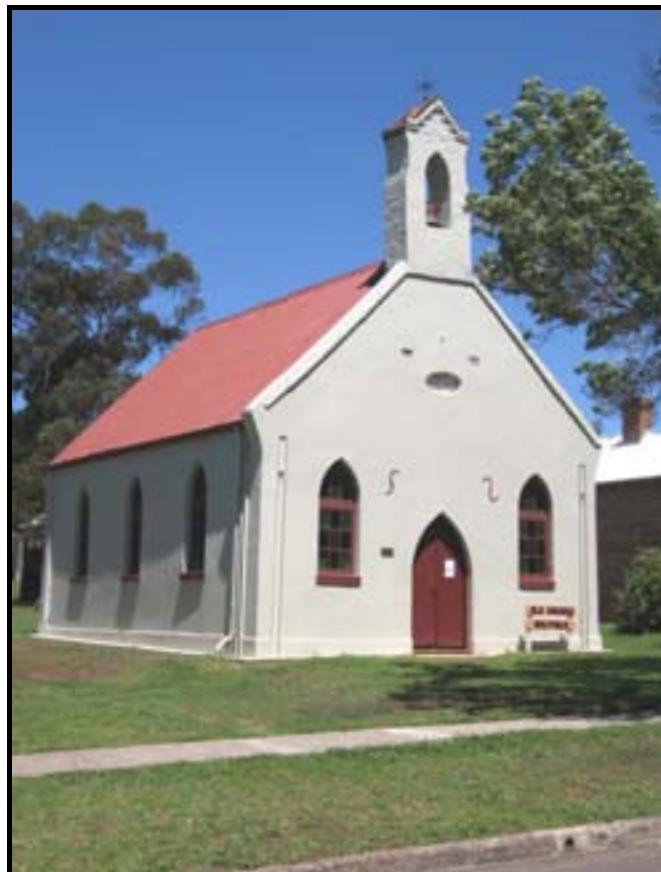
Figure 12: Primitive Methodist Church, Nundle, 2006.

The Methodist Church was opened on 9 April 1882 by the wife of the Rev. C. Waters of Morpeth. A substantial brick and stone building, the church stands in Nundle’s main street. The words ‘Primitive Methodist Church 1882’ can still be deciphered in the oval above the door. The former Methodist Church was purchased by Nundle Shire Council in 1966. After much public debate over whether the building should be demolished, it was finally decided to preserve it. During the debate over the future of the Church the Nundle and District Historical Society was formed. Until 1984 the former Methodist Church was the home of the Historical Society, but it proved too small to display adequately the Society’s collections. Today it has found a new use as a second hand clothing shop, the Old Church Boutique.