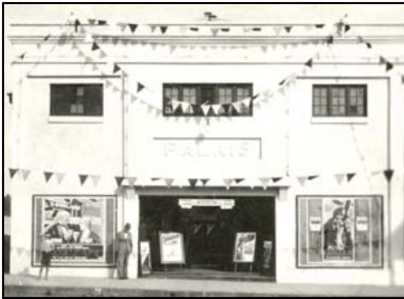
Figure 34: The Palais Theatre, Manilla, c. 1929.

The young ladies of the district, dressed in their very best, every Saturday night sat on the left hand side of the projection box, hoping with great anticipation that the young men, equally well attired, hair shining with Brylcream or California Poppy, would make that courageous move from their territory, namely the right hand side of the projection box, and select one of the young ladies as their partner for the night's program. 130