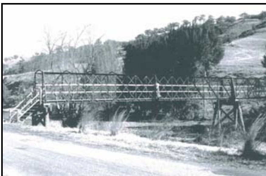
Figure 9: Bowling Alley Point footbridge in its original location, 1977.

Bessemer steel construction in the colony, the bridge was prefabricated at the steel works in Newcastle, shipped up the Hunter River to Morpeth, then transported by bullock dray over the formidable Crawney Pass. In 1958 Nundle Shire Council decided that the footbridge was dangerous and called for tenders for its disposal. After numerous calls for its preservation, Council recognised the historical value of the bridge and in 1963 allocated an estimated £150 to upgrade and repair it. The bridge was completely washed away by floodwaters in 1984. The remains of the bridge lay in the riverbed for three years until the Bicentennial Authority made $30,000 available to restore it. In late 1987 the bridge was relocated to the eastern bank of Chaffey Dam and rebuilt in time for the Bicentennial Celebrations in 1988. 47