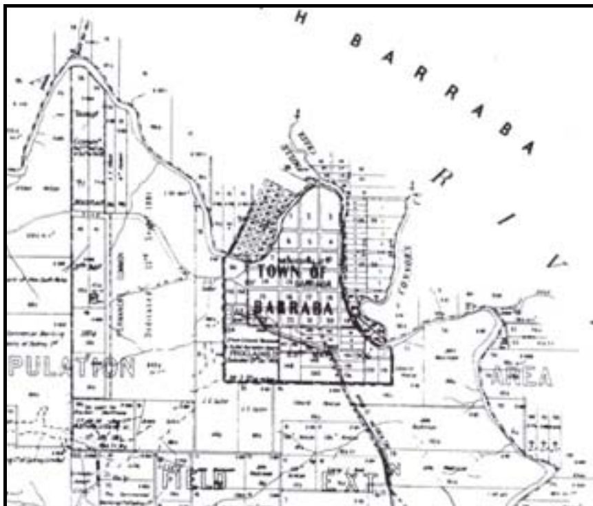
Figure 37: Detail from map of Parish of Barraba, County of Darling, Tamworth Land District, Fourth edition 17 June 1910.