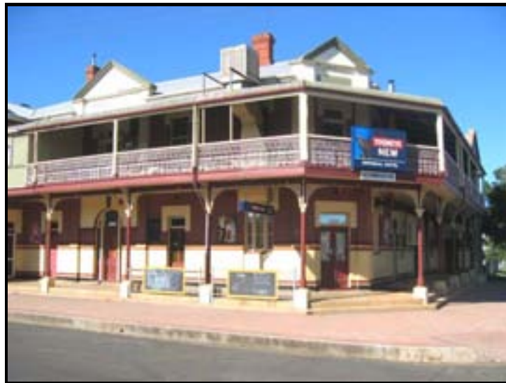
Figure 26: Imperial Hotel, Manilla, 2006.

Today three hotels operate in Manilla: the Royal Hotel, the Post Office Hotel and the Imperial Hotel. The court house Hotel closed in 2000. The Post Office Hotel is the longest running hotel in Manilla. The Royal Hotel suffered two major fires, in 1913 and in 1978. After the second fire the business was carried on in the old Namoi Café under the name Hard Rock Café, until the Royal Hotel reopened in 1979. 82 There are also three licensed clubs in Manilla: the Bowling Club, the Golf Club, and the RSL.