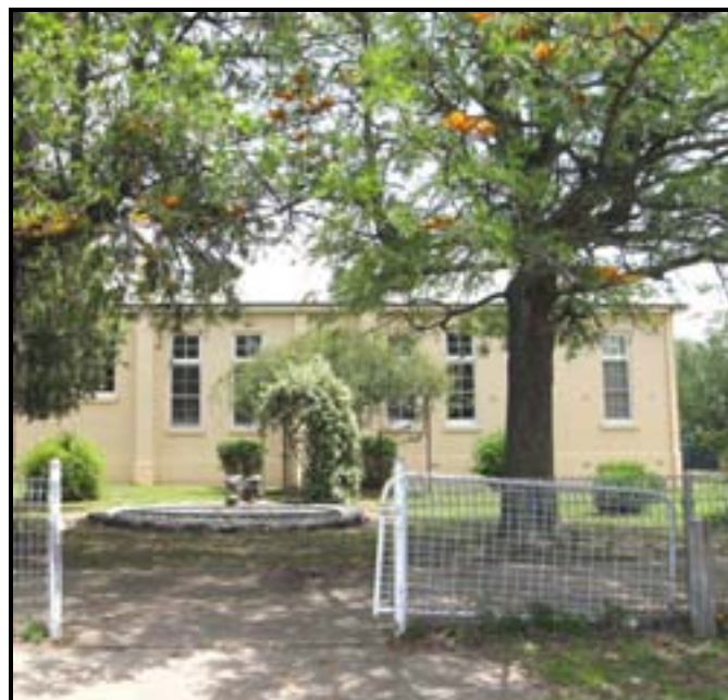
Figure 40: Barraba Central School, 2006.

In 2007 there are three schools in Barraba, two primary and one secondary. Barraba Central School has a primary campus catering for kindergarten to year 6 and a secondary campus for years 7-12. For children whose parents prefer them to have a Roman Catholic education, St Joseph's School, located next to St Joseph's Roman Catholic Church, offers classes from kindergarten to year 6. Barraba Central is one of the first schools in Australia to be equipped with solar powered computers, and is developing its own website. 52