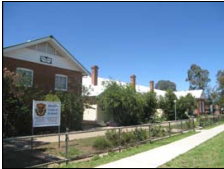
Figure 24: Manilla Central School, 2006.

By 1958 enrolments at Manilla Public School totalled 542, the highest on record, and approaches were made to the Department of Education to build a high school at Manilla. In November 1966 the new secondary school in Manilla opened, with an initial enrolment of 167 pupils. In September 1977 a week long program of celebrations was held to mark the centenary of public education in Manilla, attended by many former pupils and teachers. The program opened with a procession through the town watched by over 3,000 people, and throughout the week a variety of events were held including fetes, concerts, a combined church service, a bush picnic, open days at the school, and a centenary ball. The Yarambully bush school was officially handed over to Manilla Historical Society as a museum of education. 53