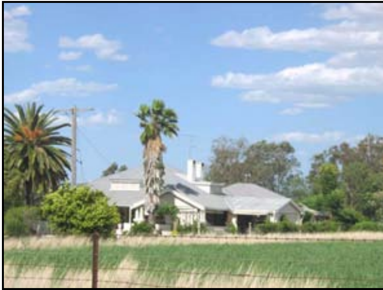
Figure 38: Mayvale, 2006.

Wheat growing in the Barraba district began on a relatively small scale in the late 1870s and 1880s. The areas under wheat cultivation increased in the 1890s as government legislation encouraged the subdivision of the large estates and closer settlement. In October 1899 the Barraba and Manilla News reported: