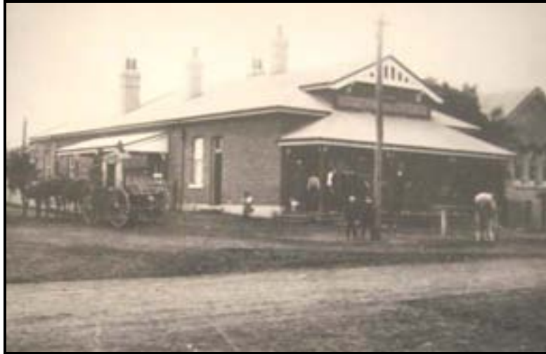
Figure 45. Mail coach outside Barraba Post Office, 1903.