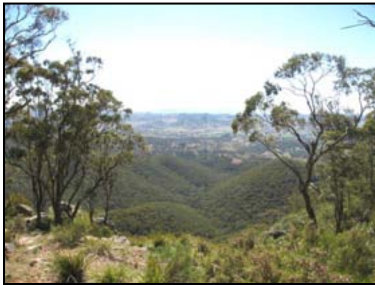
Figure 3: View from Hanging Rock, 2006.

I called to the man who stood in front of the fire (and who had short spears or other missile weapons in his hands) and beckoned to him by every sign that would be considered, even by a savage, a pacific, friendly intention, but t'was all in vain. To every sign... he simply made a brief reply, at a distance, however too great to enable me to judge how far the dialect of the natives of this part might differ from the aborigines of the settled part of the colony: and then on seeing eleven horses descend in a line to the river's brink, he took to his heels, and, with the others (four natives and a young child, among whom were women) ran off to distant parts... up the river and disappeared. 6