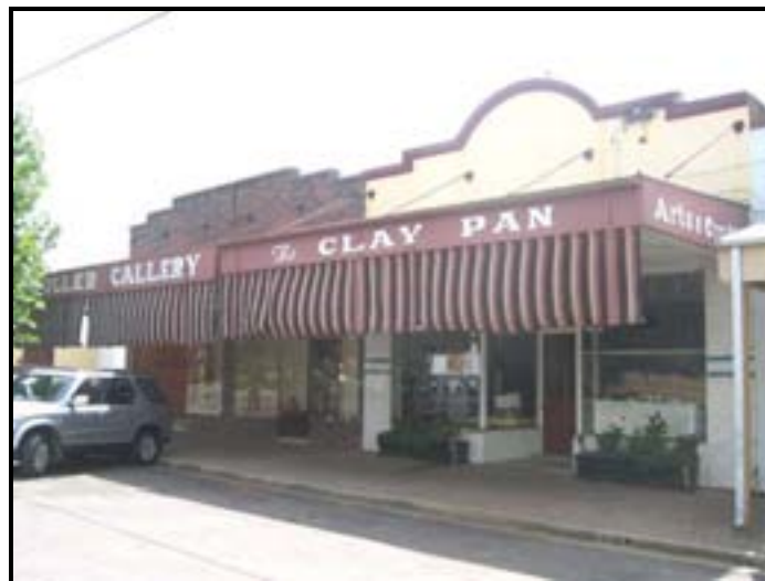
Figure 52: The Clay Pan and Fuller Gallery, Barraba, 2006.