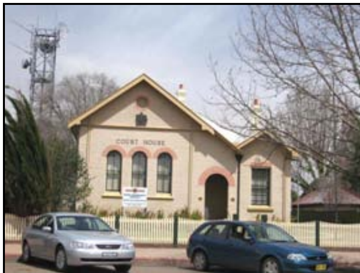
Figure 43: Barraba court house, 2006.

The court house remained in use until 1980; in 1992 the building was being used as a senior citizen's centre. A modern police station in Maude Street was built in 1979. The building was officially opened in October 1980 by the Minister for Police and Minister for Services, the Hon. W. F. Crabtree. 76