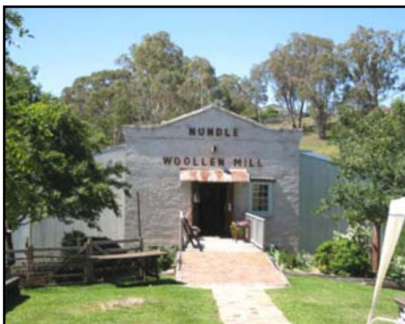
Figure 8: Nundle Woollen Mill, 2006.

Logging of hardwood forests in the Nundle district continued from the 1930s, with small local sawmills based at Walcha, Nundle, Nowendoc and Tamworth. However harvesting was sporadic due to the inaccessibility of the forests and difficulties in marketing timber. The intensity of logging increased in the 1940s to meet war time requirements, and again in the 1960s when exotic conifer plantations began to be established. The aim was to extract the maximum amount of hardwood timber prior to clearing. In the late 1970s it was decided that future establishment of Pinus radiata plantations should be limited to Hanging Rock and Nundle State Forests. 31