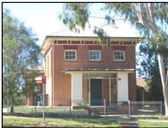
Figure 27: Manilla court house, 2006.