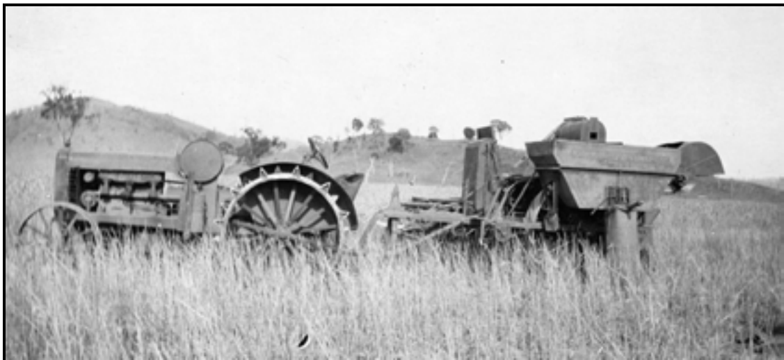
Figure 22: Harvesting at North Cuerindi, 1930.

The jobs of the bag sewers, who stitched closed the sacks of wheat, and of the carriers or lumpers who did the backbreaking work of loading the four bushel bags onto and off the drays, were soon to become redundant with the advent of mechanisation and bulk handling. Four bushel bags of wheat weighed over 108 kilograms each, and they were appropriately known as 'gut busters'. 33 In 1908 the weight of bags was limited to 90.6 kilograms. 34