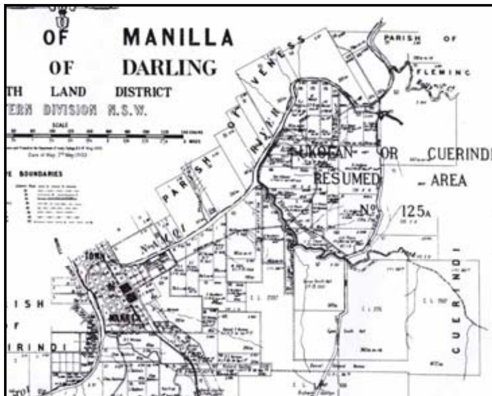
Figure 20: Detail from map of Parish of Manilla, County of Darling, Tamworth Land District, Fourth edition 7 May 1903. Parish Map Collection, State Library of NSW.

The Robertson Land Acts passed in 1861 remained in force until 1884, and the pattern of growth which they established continued. The large pastoral runs of the inland, which had remained locked up until after 1866 when their fourteen-year leases expired, were opened up to free selection. Part of these large holdings were resumed to allow small farmers to take up land, and encourage closer settlement. 14 During the 1870s and 1880s the Manilla district was opened up to free selection. Land seekers flocked to the north-west and there was keen competition. For every man who occupied land there were many others keenly watching for any breach of the lease conditions, which would give them the opportunity to jump the selection. 15 During the 1880s large-scale selection of land around Halls Creek, Upper Manilla and the Namoi River transformed Manilla from an area of large cattle stations to closer settlement. Many of the larger properties were subdivided, such as Durham Court in 1898, when 17 blocks were sold at New Mexico. Keepit Station was progressively split up from the 1870s to 1910, including for soldier settler blocks after the Boer War. 16