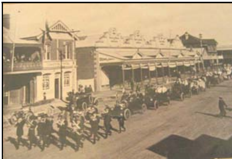
Figure 46: Parade in Queen Street Barraba in June 1916 to celebrate the work carried out by the Shire Council to kerb and gutter the main street and improve the road surface.

The first priorities of the new councils were improving roads in the wider shire and forming and kerbing and guttering the streets of Barraba township. In 1911 all the road plant acquired by the Municipal Council was displayed outside the Victoria Hotel for citizens to admire. The plant included a stone crusher, gravel hoppers, and ploughs drawn by a steam tractor engine and other smaller vehicles.