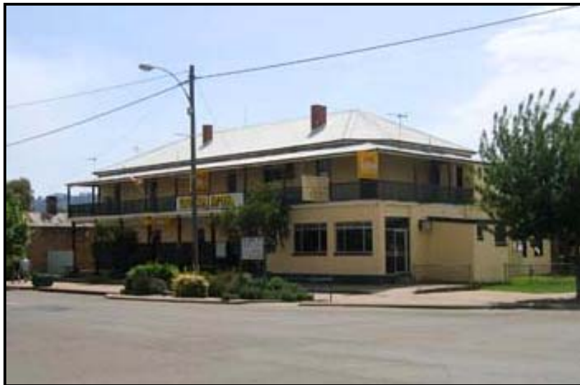
Figure 42: Victoria Hotel, Barraba, 2006.

Hotels in outlying villages were important social centres, particularly before the era of the motor car. During the heyday of copper mining at Gulf Creek between 1900 and 1904 miners spent their leisure hours drinking and gambling at the hotel and billiard hall, and they could become rowdy, particularly on paydays. On one occasion some patrons refused to leave the bar when closing time came and the publican had to resort to subterfuge. He got a couple of men to pick a fight and when all the drinkers moved outside to see the dispute settled, he firmly closed the doors behind them. In December 1899 the Gulf Creek Progress Committee asked for a police officer to be stationed at Gulf Creek to maintain law and order. 70 At Upper Horton John Gainen was operating the 'My Venture' hotel by the 1880s. The teacher at Horton Upper School, from 1891 to 1894, Mary White, lodged at the hotel, which was within sight of the school, as did many of her predecessors. Normally the Education Department frowned on teachers living in hotels, particularly young women. But by all accounts the hotel was a well run affair, suitable for the lodging of single women, and the publican was a patron of the school. 71 Today the life of the village centres around the Upper Horton Sports Club.