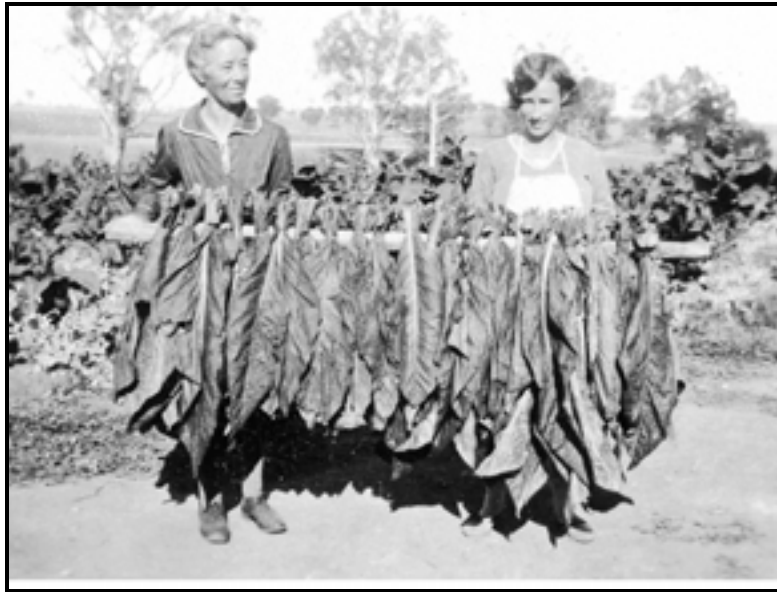
Figure 23: Tobacco drying at Manilla, 1930.

agreement. The proposal was dropped, marking the death knell of the tobacco industry in northern New South Wales. The conference was decades too late, and by the time it was held many experienced growers had left the industry. 40 By 1949 there were few tobacco growers left in the Manilla district. Italians grew some tobacco at Moore Creek north east of Tamworth into the 1970s, and there were also barns and drying sheds around Ashford and up to the Queensland border. 41