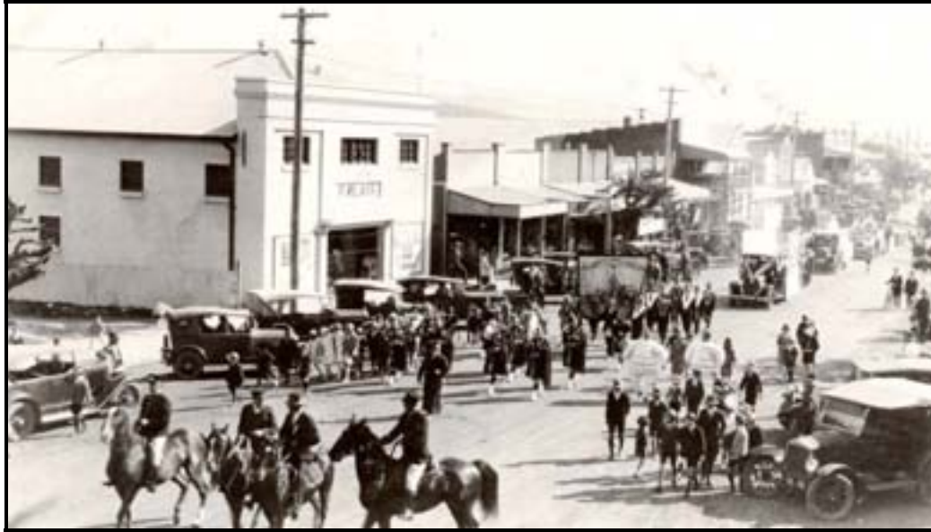
Figure 33: Farmers' Carnival parade, 1929.

pavilion, and the Historical Society's display of photographs, ribbons, trophies and other memorabilia from past shows dating back to the early farmers' carnivals. 119