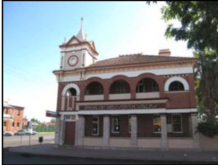
Figure 32: Bank of NSW, Manilla, 2006.

Manilla from 2001 in the former Commonwealth Bank building. In 2005 the Peel Valley Credit Union merged with the New England Credit Union.