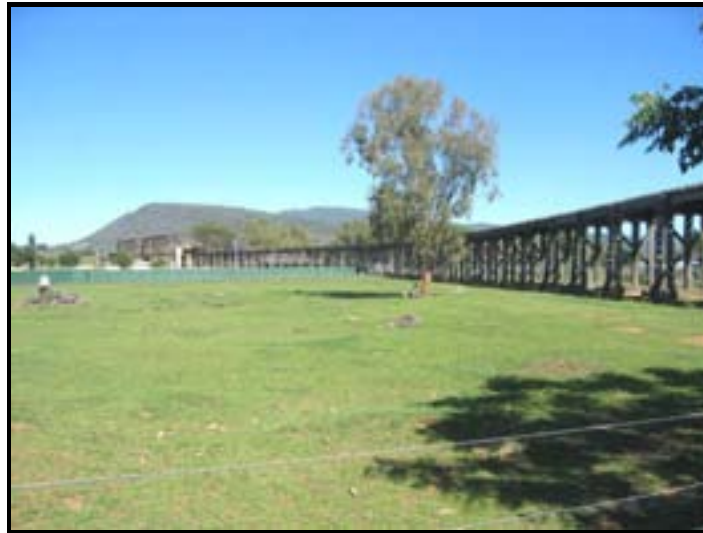
Figure 6: Manilla railway viaduct, 2006.

As much of Bingara's passengers, goods and produce (especially wool) arrive or are despatched from Barraba, the station is a very busy one, with a passenger train daily except Sundays and a goods train three days per week, and in the wool and wheat season many extra trains have to run to cope with the business, considering that nearly 19,000 bales had to be conveyed in the seven months of the 1945 – 1946 wool season. 30