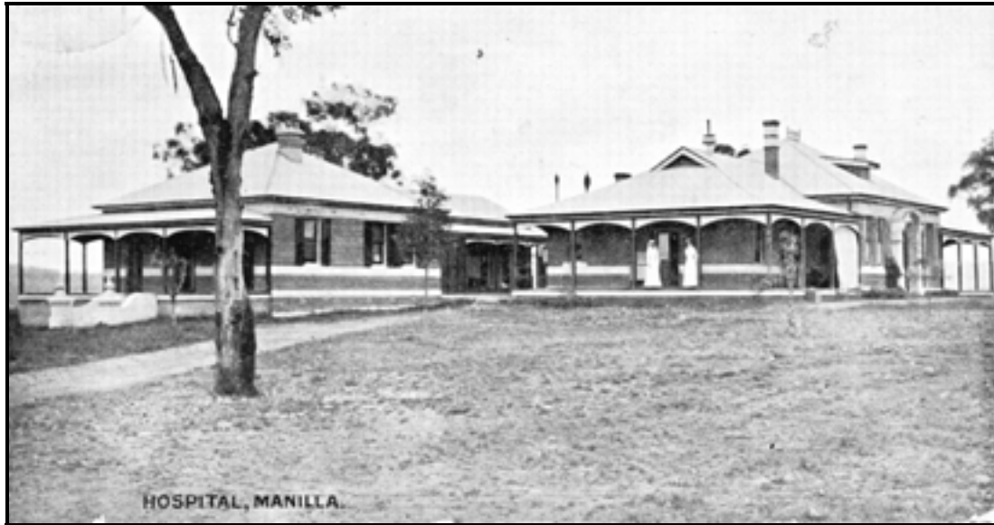
Figure 28. Manilla Hospital, c.1910. The nurses' home is on the left.

benefactor Mrs Susan Hill. Two new wards were built in 1935, and in 1937 James McIlrath donated £500 for a new children's ward. A modernised operating theatre opened in 1952, and in September 1956 a new nurses home opened, replacing the old nurses quarters which had been partially destroyed by fire in 1948. More recent additions to the facilities at the hospital are an administration block, built in 1962, and a new maternity ward, opened in November 1967. 89