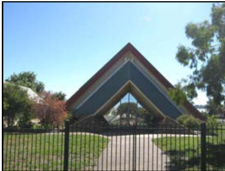
Figure 25: St Andrew's Church, Manilla, 2006.

On 29 June 1968 over 600 people attended the opening and dedication of the new St Andrew's Church in Manilla. Designed by architect Ian McKay, the modern church seats 160. The ceiling steps down from the crown of the church to focus attention on the centre of worship, the altar, and together with the skylight forms a lofty yet intimate space for worship. Plywood was used to construct the roof and encase the roof trusses, creating a light, flexible structure that would tolerate the movements of the deep alluvial black soil of the site. 71 When the Uniting Church was formed in 1977, the Presbyterian congregation of Manilla chose to remain as an independent Presbyterian Church and combined with West Tamworth Presbyterian Church. 72