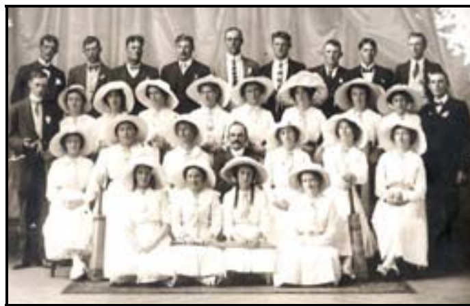
Figure 35: Manilla Ladies Cricket Team off to play NSW Parliament, 1914.

The Manilla Cricket Club became the Manilla Cricket Association in 1901. The Association has been active for over a century, fielding teams against Tamworth, Barraba, Upper Manilla, Wongo Creek and Halls Creek and participating in interclub matches as far afield as Newcastle, Uralla, Armidale, Inverell and Guyra. Cricket was not just the preserve of men. Manilla, Halls Creek and Wongo Creek fielded women's teams as early as 1914. The Manilla women's team even travelled to Sydney to play against Bexley Ladies Club and a representative team from Parliament. They were accompanied by two chaperones to protect them from the vices of the city. 137