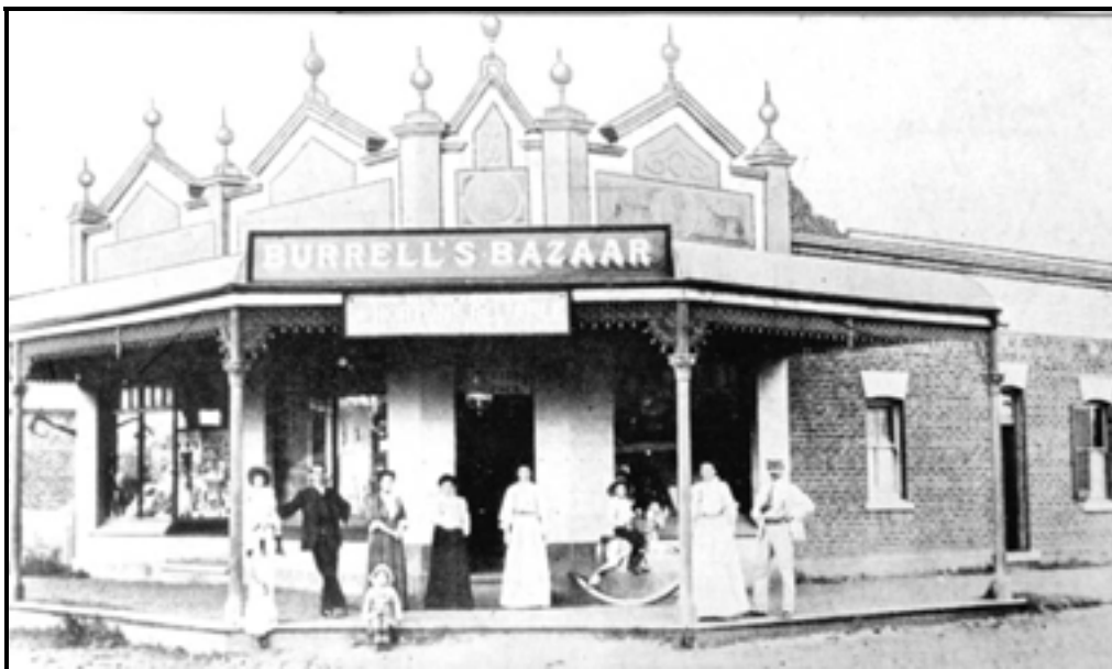
Figure 31: Burrell's Bazaar, Manilla, 1910s.