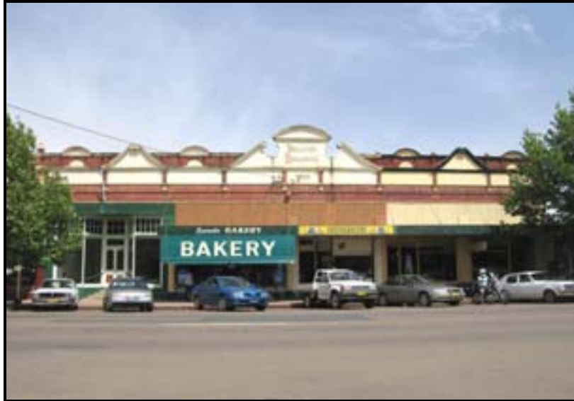
Figure 48: Treloar's Buildings, Barraba, 2006.