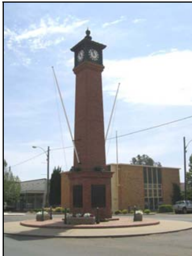
Figure 50: Memorial clock tower, Queen Street, Barraba, 2006.

During both world wars men from surrounding villages joined the recruiting drive, and local residents held functions to support their boys at the front. Socials, sports days, euchre parties and stalls were held to raise funds for the war effort. Honour boards were erected in country halls, churches and schools to honour those who served their country. For example at Gulf Creek a Roll of Honour board was attached to the wall of the school house, which in the 1980s was being used as the tennis club house. 122 In January 1941 the Barraba Gazette reported a function held to farewell 24 Barraba men who were leaving to serve in the armed forces. The Citizens Welfare Committee presented each man with a suede leather belt inscribed with their name, and a two pound note from the Lord Mayor's Fund. The Greek Community presented the departing soldiers with cigarettes, and following the formalities the large crowd danced to the music of the Barraba Town and District Band. 123