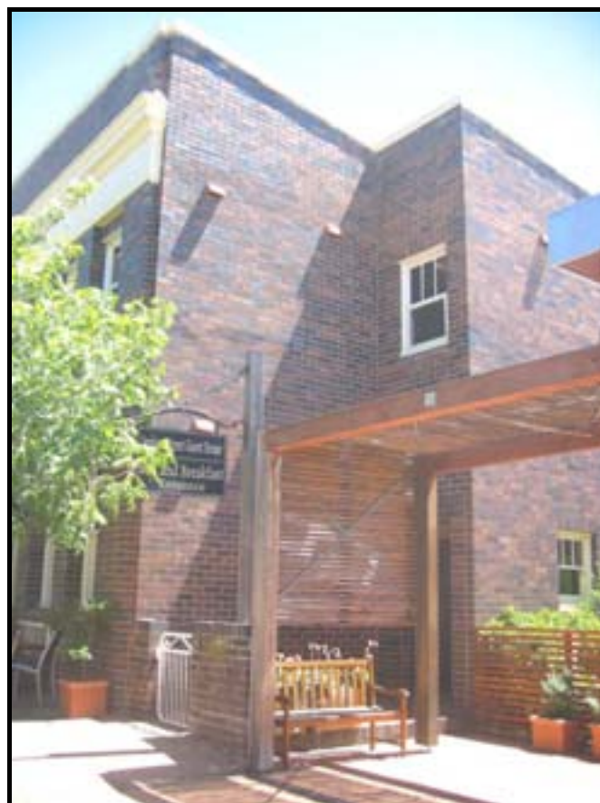
Figure 19: Jenkins Street Guest House, Nundle, 2006.

In 2006 tourism has generated new life and energy in the small town of Nundle, while preserving its country village atmosphere. Making the most of its rich gold mining heritage, many of the buildings of the main street have been transformed into galleries, shops and tourist accommodation. The Jenkins Street Guest House, formerly the town's bank, has been elegantly restored and offers luxurious accommodation and a popular restaurant. Visitors can stroll down the main street browsing in antique shops, craft shops and stores selling hand-made country furniture. 'The Cottage on the Hill' Patchwork Studio, operated for many years by Kerry Swain, offers patchwork classes as well as supplies. It is an important Nundle tourist attraction, making a significant contribution to the local economy. In Oakenville Street the Golden Hills Art Gallery incorporates the studios of artists Howard Ireland and Nadia O'Loughlin. The building housing the gallery has had a colourful history. Originally a coffin factory, it was for some years the home of the Mount Misery Underground Gold Mine and Gold Museum.