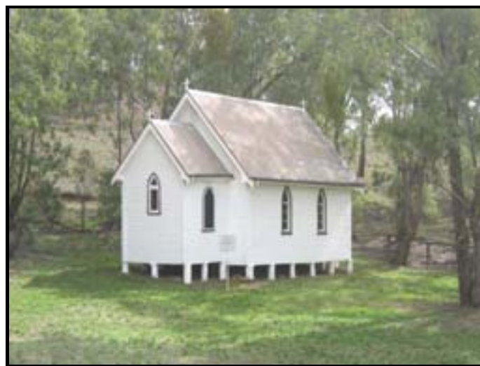
Figure 41: St John's Church, Woodsreef, 2006.

Over the years St Laurence's Church of England has played an active role in the Barraba community, developing outreach programs for senior citizens and children and young people. Club programs for primary and secondary school age children were developed in place of Sunday School, and a monthly magazine for infants and primary children, with stories, puzzles and competitions was produced. The Frost Over Barraba art exhibition, first held in 1974, remains an important source of funds for the Anglican Church. It has grown into a major annual cultural event in Barraba. 64