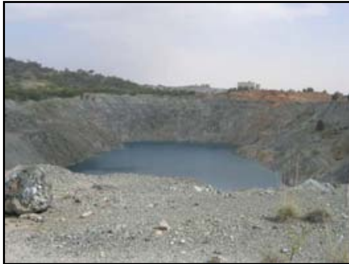
Figure 39: Woodsreef asbestos mine site, 2006.

By this time the health hazards of asbestos were well publicised, and between 1980 and 1984 consumption of asbestos in Australia fell from 70,000 to 10,000 tonnes. 33 During the 1970s James Hardie Industries had already been reducing the asbestos content of its building and insulation products and developing alternatives. Working conditions at the Woodsreef mine were extremely poor and very high dust counts prevailed, because the mine had been designed for the sub-zero temperatures of the northern hemisphere. Workers were transported to the mine from dormitories twelve miles away in buses that were later used to take their children to school, and little dust monitoring took place. In his book Asbestos House , charting the rise and fall of James Hardie Industries, Gordon Haigh quotes the vivid portrait of Woodsreef painted by journalist Matt Peacock: