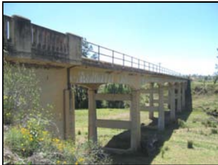
Figure 5: Manilla River road bridge, constructed in 1942.

When the first privately owned motor vehicles appeared in Manilla in 1907 they provoked a wave of protest from local residents. They were concerned about the unheard of speed at which these vehicles travelled and imagined a spate of accidents. By 1911 several Manilla residents owned cars. 20 In 1917 the Trust Account book of the Methodist Church in Barraba records the change from the cost of maintaining a horse and sulky to the cost of a Douglas motorbike. By the late 1920s a single seater model T Ford was bought for the use of the Rev. Middleton Taylor on the church circuit. By all accounts the Reverend was not the best of drivers; he crashed the car into the back wall of the garage at Chadleigh twice. 21