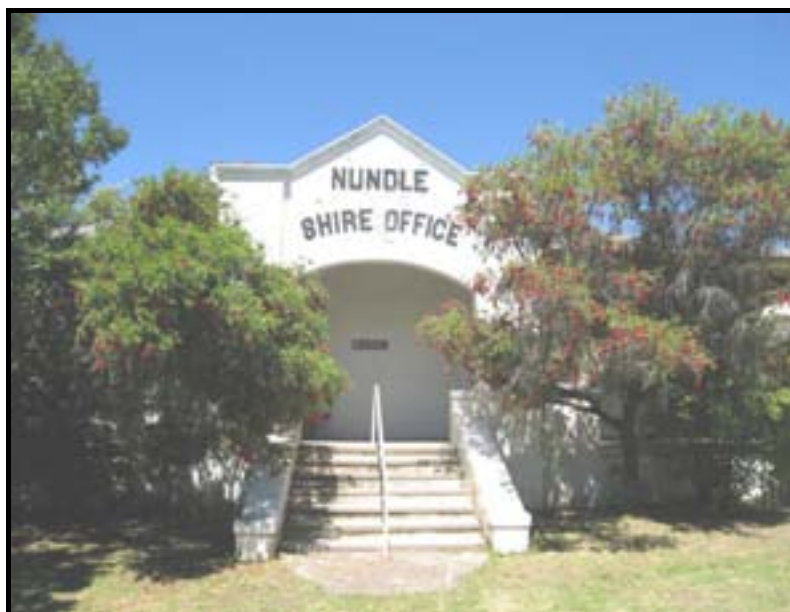
Figure 15: Former Nundle Shire Office, now occupied by Nundle office of Tamworth Regional Council, 2006.

1913, on the corner of Jenkins and Innes Streets. At the suggestion of the then president, Donald Crichton, the motto 'Candore et Prudentia' ('with sincerity and discretion') was engraved on a marble tablet on the new building.