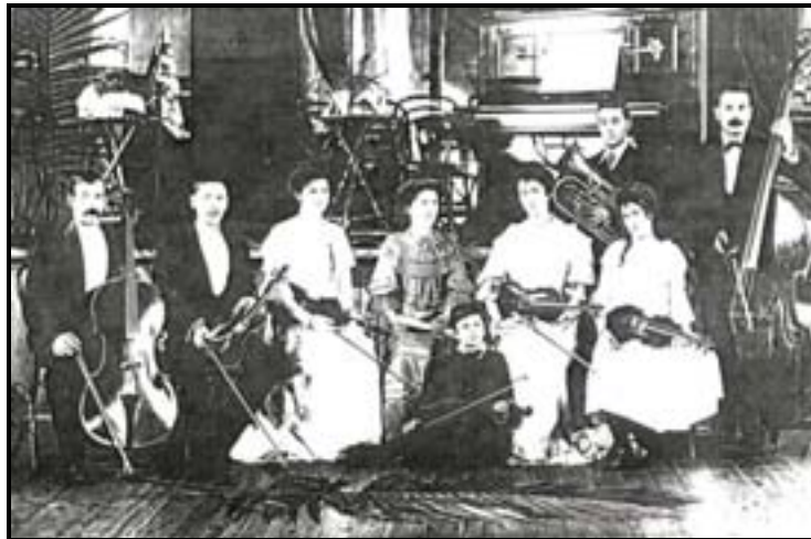
Figure 36: Manilla orchestra, early 1900s.

In addition to public meetings, bazaars, concerts, dances and balls, the Mechanics Institute was an ideal venue for the Manilla Dramatic Society to stage productions. Land auctions were held there, and as some early wedding certificates show, weddings were also celebrated in the building. The Mechanics Institute burnt down in 1913 and was replaced by a more substantial brick building which was opened in January 1914. In 1923 the war memorial committee took over the original hall, which had survived the fire, and converted it into a memorial hall. From 1923 to 1929 open air picture shows were held at the rear of the Mechanics Institute. The Municipal Council took over control of the hall in 1942. 143 After the Mandowa Shire Council and Manilla Municipal Council amalgamated in late 1959, the hall was renovated. The new library, the renovated memorial hall and a small town hall were officially opened in April 1960. 144 For thirty years from 1965 the memorial hall was the venue for the annual Festival of Spring Flowers presented by the Manilla Horticultural Society. With a different theme each year, the festival attracted many visitors.