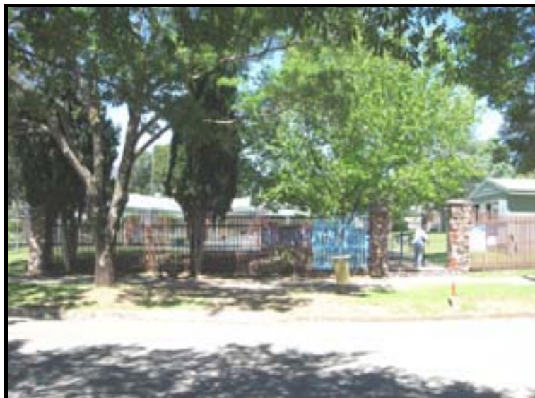
Figure 18: Nundle swimming pool, 2006.

Today Nundle has excellent sporting facilities for such a small town. They include the swimming pool, and a park and recreation ground dedicated in 1901. The oval beside the Peel River provides a picturesque venue for cricket and football. There are four tennis courts in the town, the first built in the early 1900s and the second two added in 1945. Across the river in West Nundle a bowling green was laid out and opened in March 1952, and a club house was built beside it, now the Nundle Sport and Recreation Club. Sporting clubs in Nundle include the Campdraft Committee, Amateur Swimming Club, Fishing Club, Pony Club, and Nundle Women's Bowlers. The Nundle Bushwalking Committee organises walks on the first Saturday of each month.