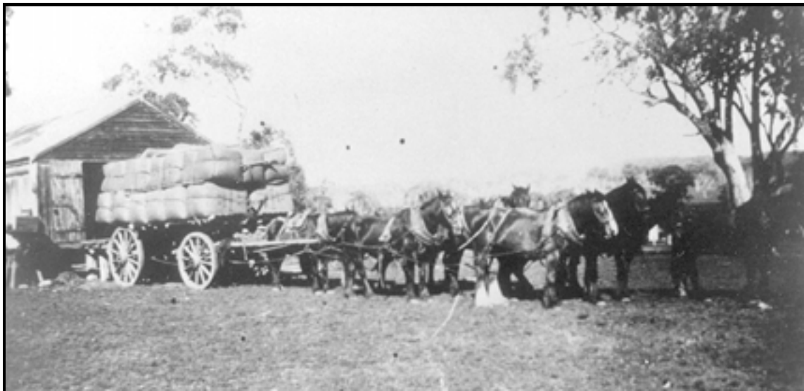
Figure 21: Wool bales leaving Everton Station.