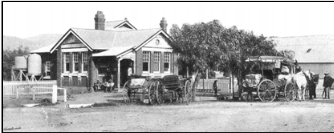
Figure 4: The mail coach at Manilla Post Office, early 1900s.