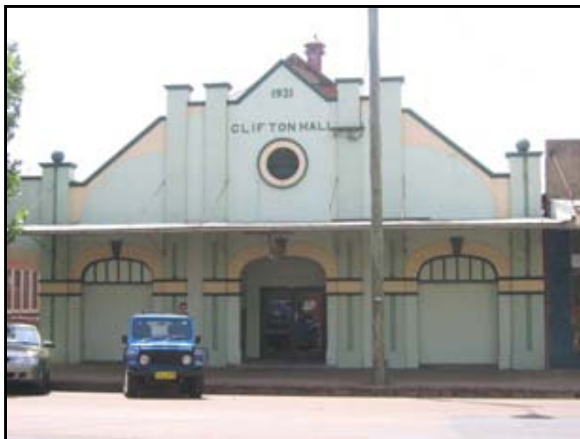
Figure 51: Clifton Hall, Barraba, 2006.

Clifton Hall was the major entertainment venue in Barraba for many years. The hall was built in about 1915, although the date on the façade is 1921. The exact date of construction is hard to pinpoint because few building records have been preserved. It is possible that the façade was added in 1921. The building was extended in the late 1920s to accommodate an open air theatre at the rear. The hall was the venue for concerts, dances as well as live theatre productions and films. It was also known as the Empire Theatre. According to local memory the dance floor at Clifton Hall was not as good as the one at the Mechanics Institute. 132