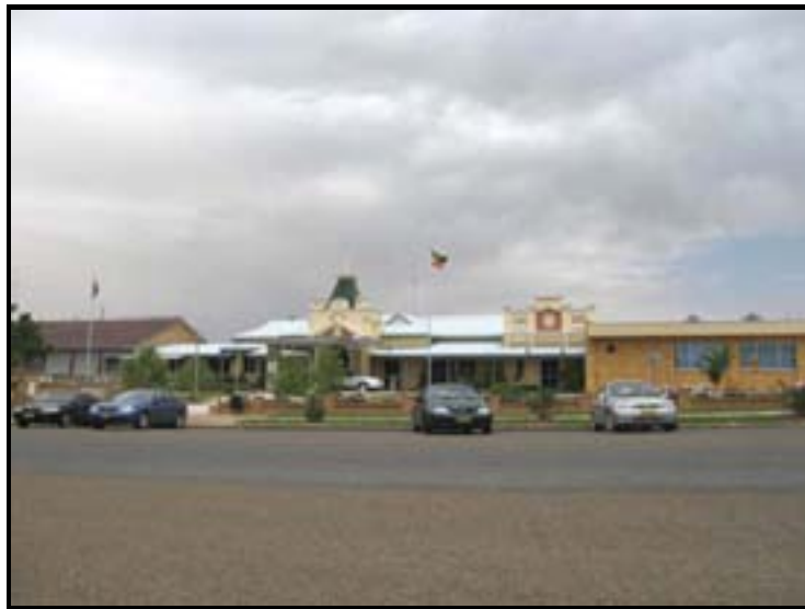
Figure 44: Barraba Hospital, 2006.

A most professional service, with friendly staff and a strong commitment. This is the best place to learn what nursing and health care is all about - I learnt more here than on any of my pracs. in major hospitals. 87