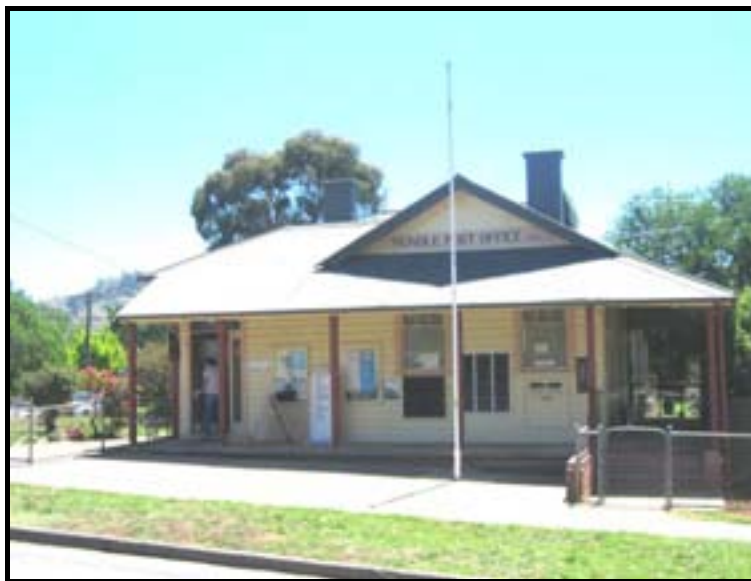
Figure 14: Nundle Post Office, 2006.

In 1880 the telegraph line from Tamworth to Nundle was completed, and on 21 January 1881 William G. Drew was appointed telegraph master in Nundle. A telegraph office opened in Nundle a few weeks later, in separate premises from the post office. The post office and telegraph office were amalgamated in 1884 under the charge of William Drew. In February 1904 a new weatherboard post office was completed on land reserved from part of the public school site on Oakenville Street. The Nundle Progress Committee had made representations to the NSW Parliament for a new post office as early as February 1900. 101 Among the facilities provided were a soundproof cabinet for the telephone, counter and writing slopes in the public area and a horse rail in front of the building. On the evidence of the volume of business transactions, in 1913 the Nundle Post Office was reinstated as an official post office. It had been downgraded to a non-official office some time before 1904. 102