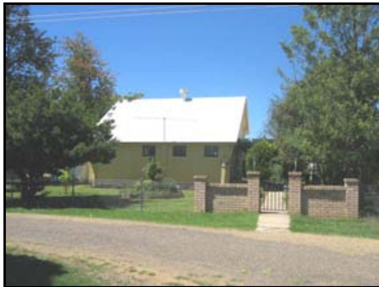
Figure 11: Woolomin School, 2006.

During the nineteenth century and into the twentieth century there were a number of other small schools in outlying settlements in the Nundle district. Schools operated at Wombramurra between 1879 and 1897, and at Goonoo Goonoo from 1869 to 1871 and 1876 to 1915. The school at Goonoo Goonoo reopened again in 1930, finally closing in 1966. In their history of Nundle, Hills of Gold , William Bayley and Ian Lobsey also refer to schools at Craigview and Ben Hall’s Creek during the first decade of the twentieth century. 68