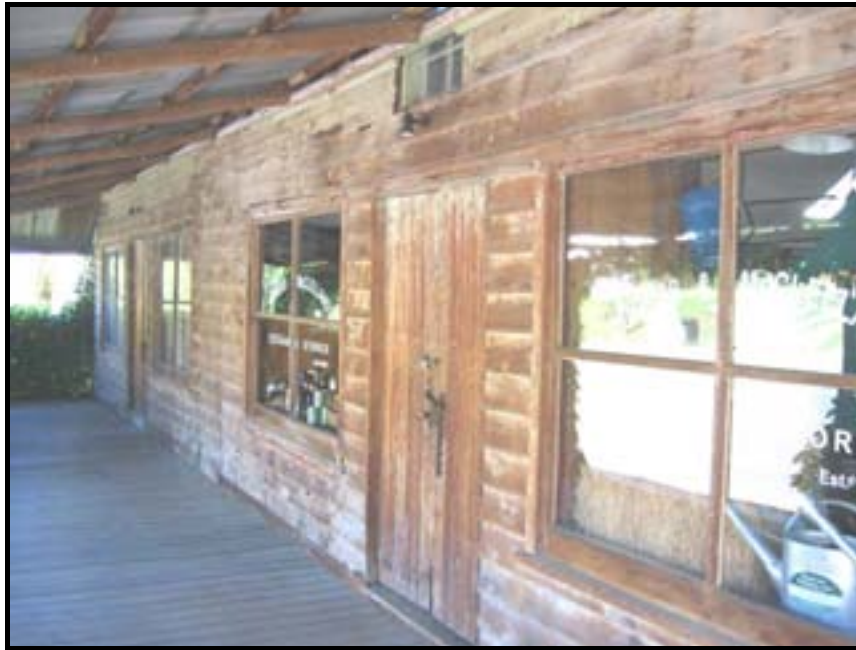
Figure 16: Odgers & McClelland Exchange Store, Nundle, 2006.